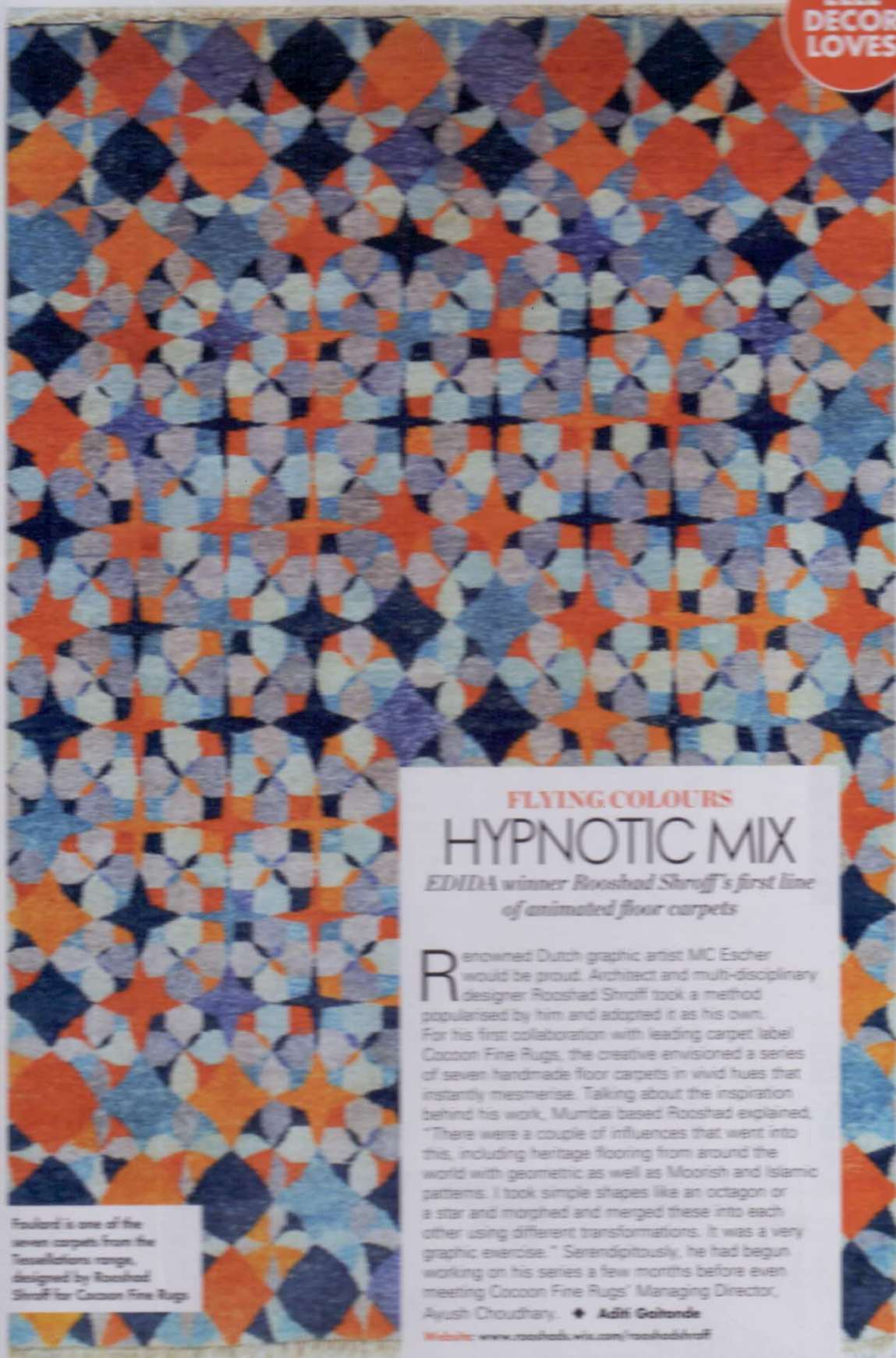
Foulard is one of the seven carpets from the Tessellations range, designed by Rooshad Shroff for Cocoon Fine Rugs