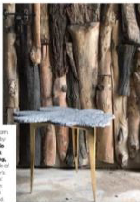
(Clockwise from top) Works by IDAM, Studio Metalurgy, Savana Living, and the facade of Le Corbusier's Mill Owners' Association building in Ahmedabad