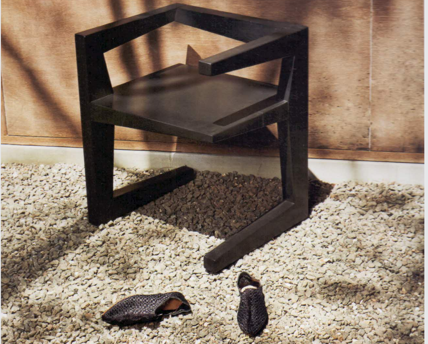
C-Chair by Rooshad Shroff, 2012