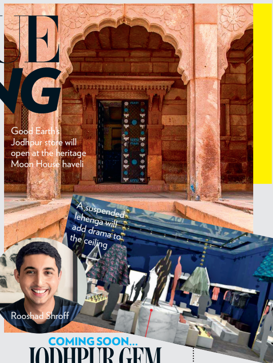
Good Earth's Jodhpur store will open at the heritage Moon House haveli