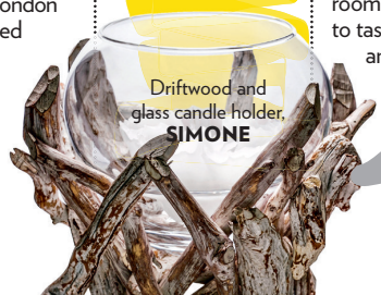
Driftwood and glass candle holder, SIMONE

If you're looking for decor ideas in a muted palette with earthy textures, Simone Arora's eponymous Mumbai store is your one-stop shop. Take this rustic candle holder, which can instantly turn a city apartment into a tranquil den. Simone.com