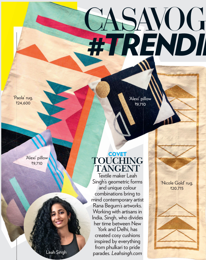
'Paola' rug, ₹24,600