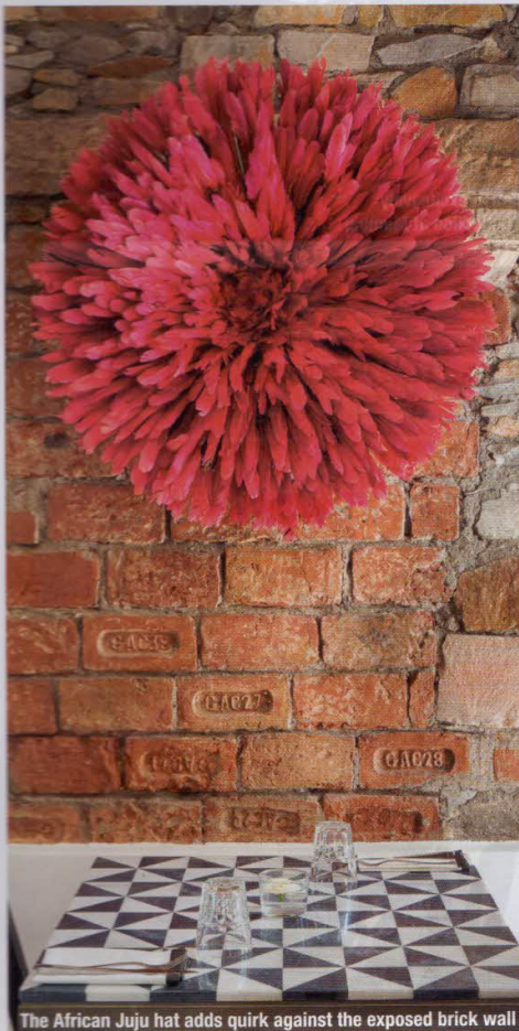
The African Juju hat adds quirk against the exposed brick wall