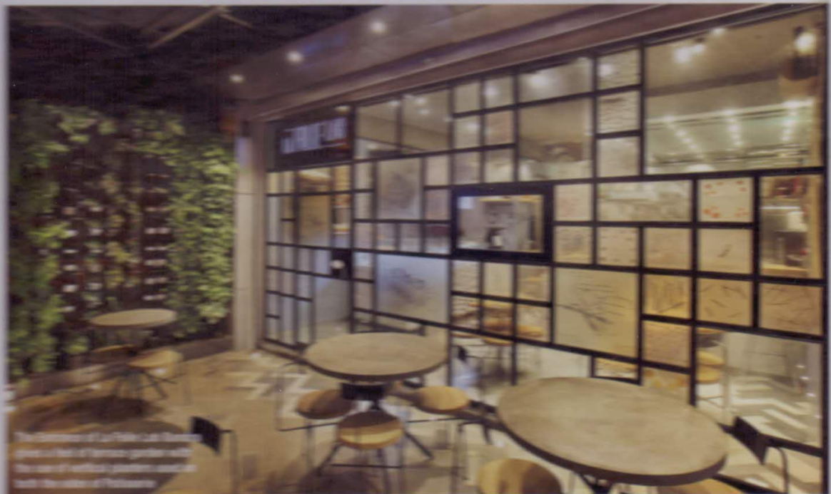
The charm of traditional craft is dwindling and the only way to sustain that kind of craft is by pushing the limit of craftsmen and by evolving the craft in some form of design which is more contemporary