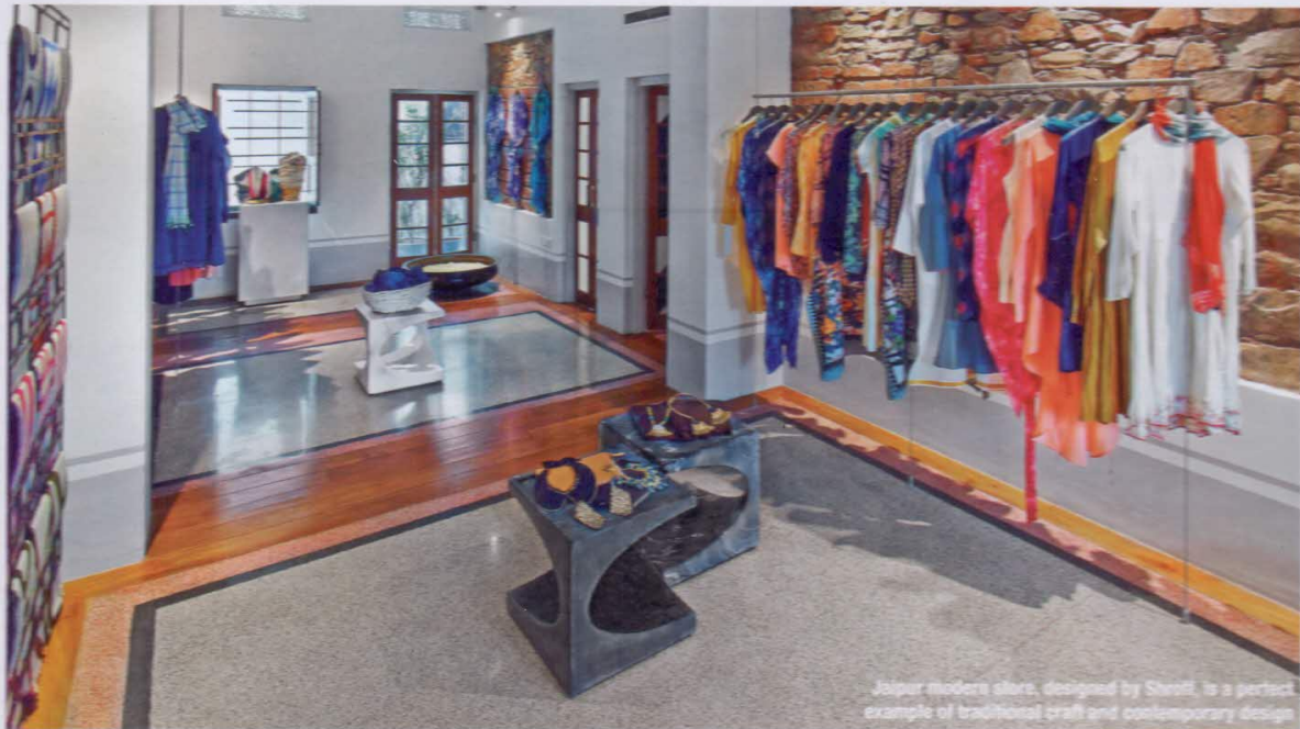
Jaipur modern store, designed by Shroff, is a perfect example of traditional craft and contemporary design