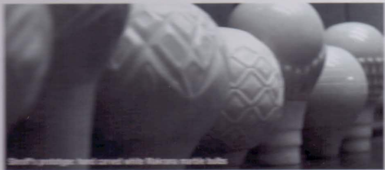
Shroff's prototype hand-carved with Makrana marble bulbs

The charm of traditional craft is dwindling and the only way to sustain that kind of craft is by pushing the limit of craftsmen and by evolving the craft in some form of design which is more contemporary