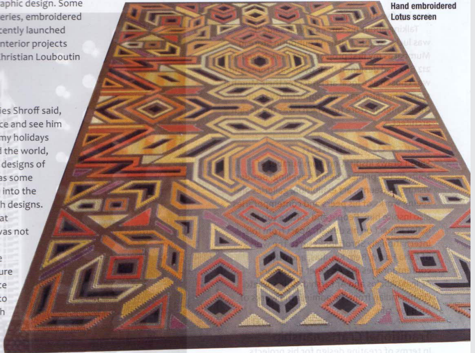
Hand embroidered Lotus screen