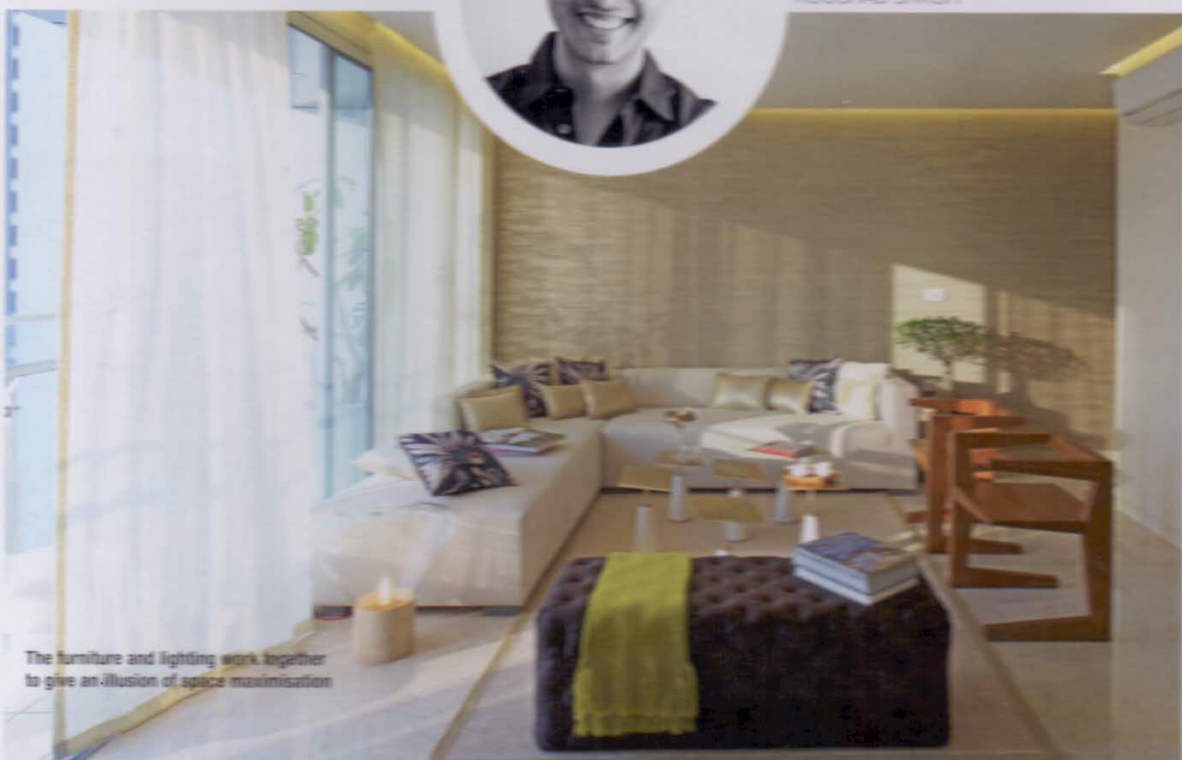
The furniture and lighting work together to give an illusion of space maximisation

W hen renowned designer Rooshad Shroff was enlisted to design a show flat for Oberoi Exquisite, he gave the show flat a life of its own. The display apartment exudes an individualistic appeal with its hand-carved forms and textures. Shroff, who is well-known to celebrate local artisan and craftsmanship through his designs, has created an ambience that follows a continuous theme throughout.