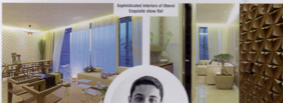
Sophisticated interiors of Oberoi Exquisite show flat