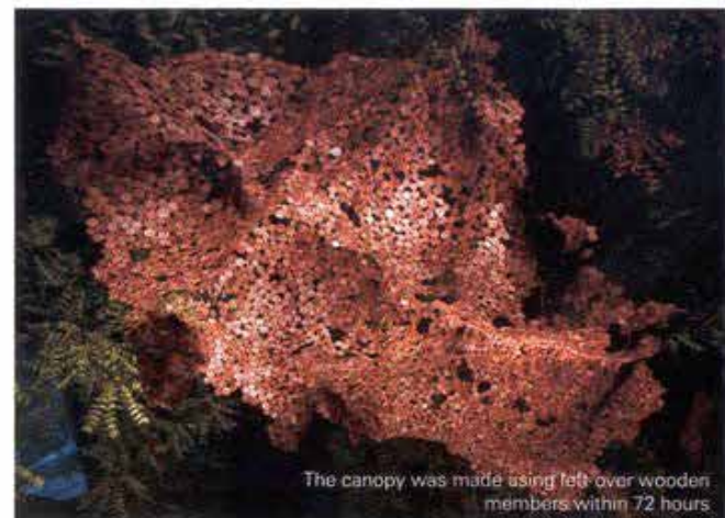
The canopy was made using left-over wooden members within 72 hours

The design proposed was to deconstruct the members by way of slicing each piece - whereby 70